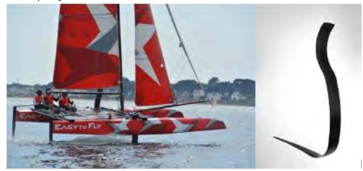
Left: Bateau Easy To Fly // right: Foil produced by AVEL Robotics for the FoilAddict project

Through the FoilAddict project, the aim of the consortium** is to work on these manufacturing processes and combine them to confirm their technical suitability (geometric and mechanical characteristics) and economic viability (costs