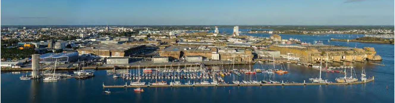
BRETAGNE SAILING VALLEY