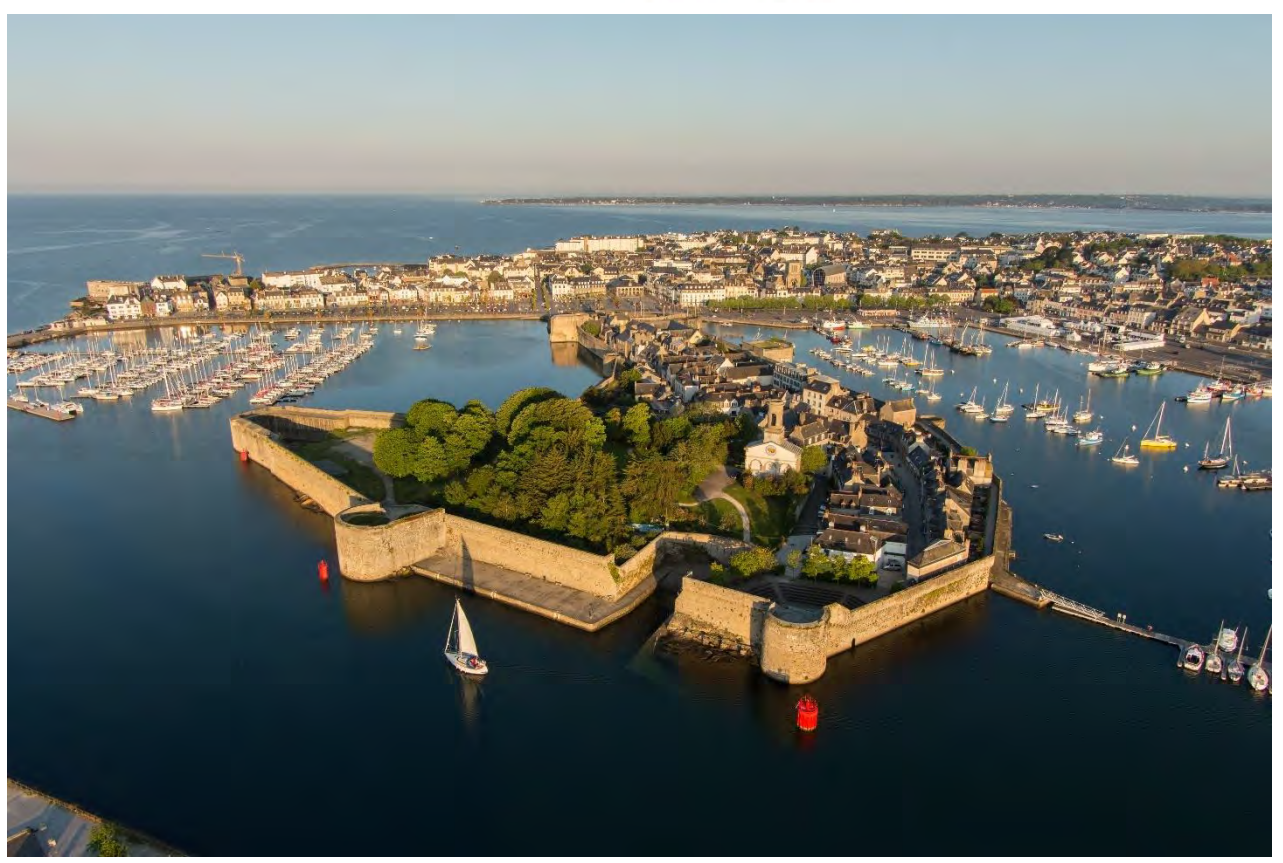
BRETAGNE SAILING VALLEY